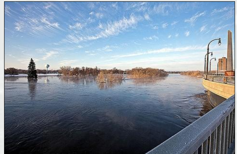
Fargo-Moorhead - 2009