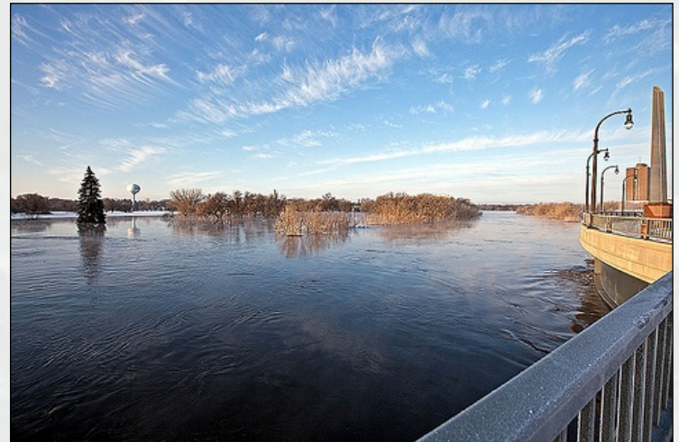
Fargo-Moorhead - 2009